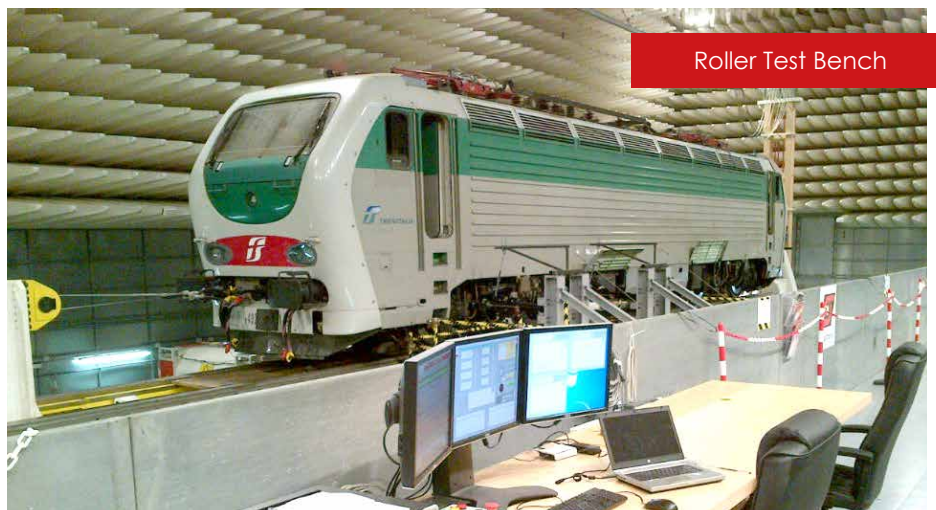
Roller Test Bench