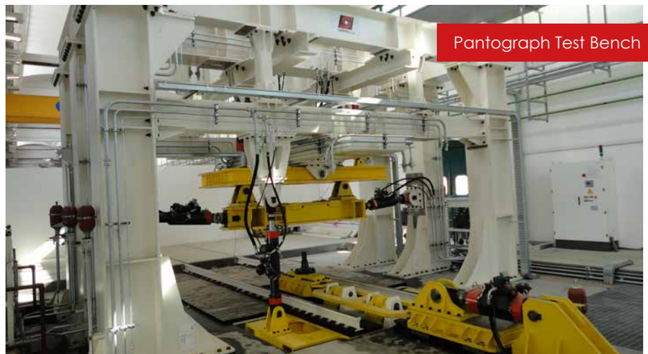
Pantograph Test Bench